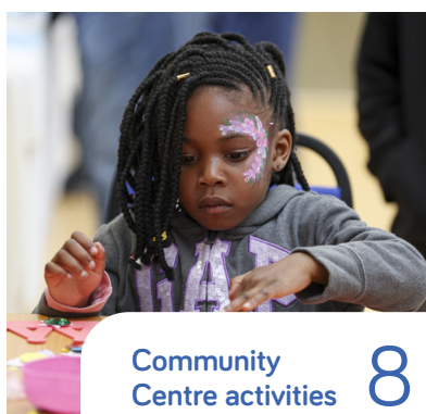
Community Centre activities