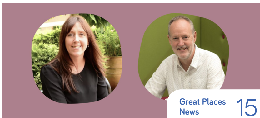
Great Places News 15