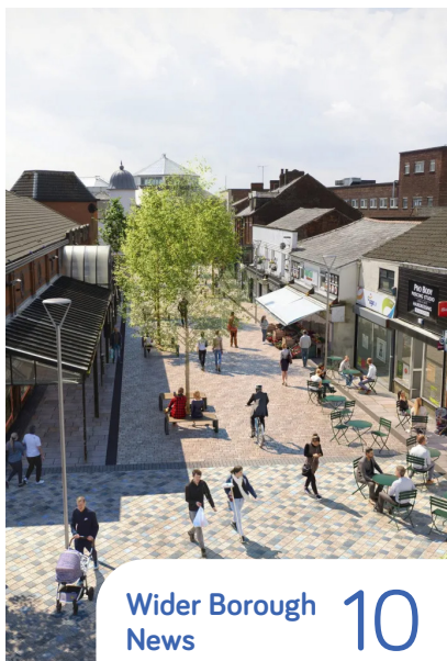
Wider Borough News 10