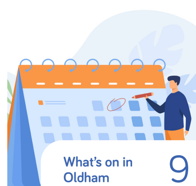
What's on in Oldham