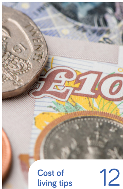
Cost of living tips 12