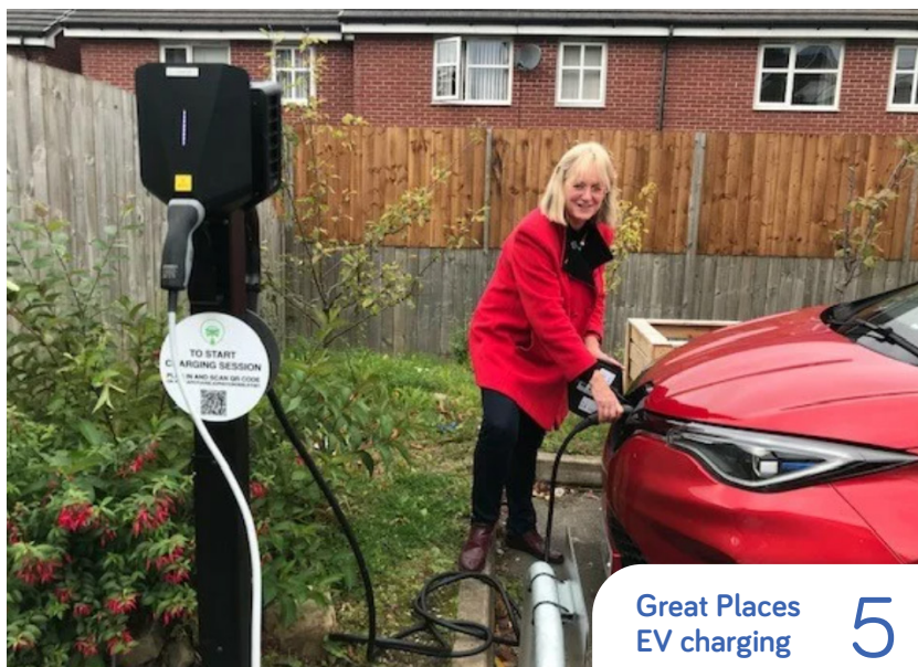
Great Places EV charging